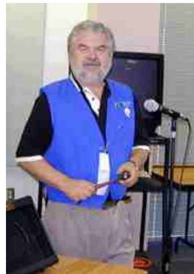
Pictur e 4