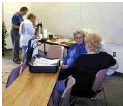
Pictur e 2